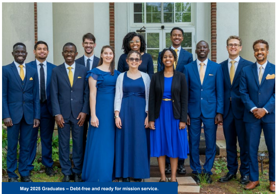
May 2025 Graduates – Debt-free and ready for mission service.